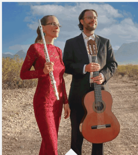
GUEST MUSICIANS Folias Duo